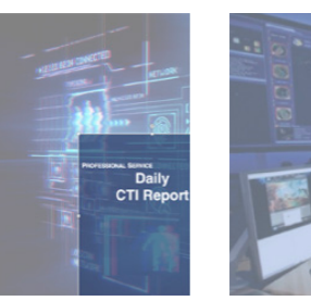
Daily CTI reports